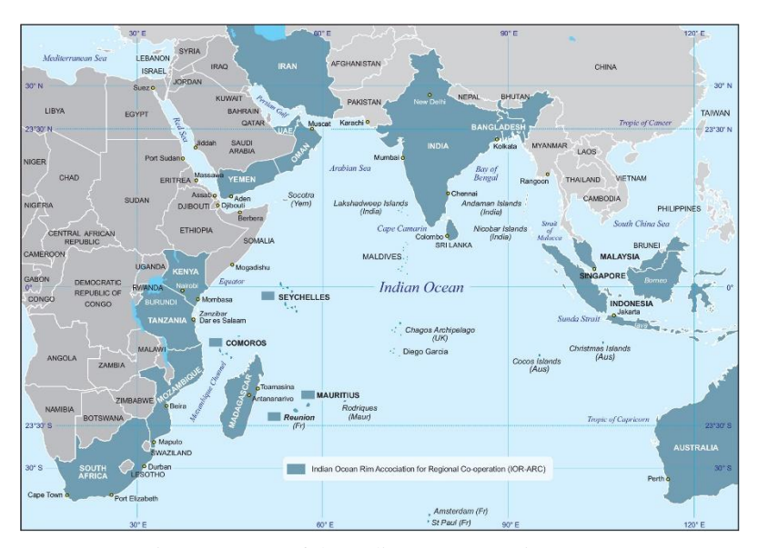
Figure 2: Map of the Indian Ocean Region – IOR

It can be noted that the 'Sea Power' theory has long been a significant theoretical impute in the study of ocean politics (Sumida, 2001; Mohan, 2022), whereas, studies of the Indian Ocean do place a significant emphasis on the modus operandi of 'sea power', making use of the interactions of great powers such as India and China (Kaplan, 2009, p.27). Kaplan who examines the Indian Ocean's strategic and geopolitical parameters stated that the Indian Ocean has become China's 'zone of influence' (ibid). The two theoretical assessments show the significance of the sea as a source of power for great powers, currently being embraced as a national strategy by both India and China. Consequently, their association with Sri Lanka, the country being a small state situated in the heart of the Indian Ocean can be perceived as a window of opportunity for making their preferred maritime connectivity. For a better understanding of the geographical positioning of the Indian Ocean Region (IOR), the following map (see figure 02 ) is presented.